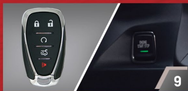
KEYLESS OPEN AND START/STOP

Up the ante on style with a complete Rally Sport package that is sure to give you commanding presence on the road.