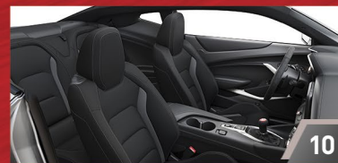
POWER DRIVER AND PASSENGER SEATS

Add ease and convenience with the remote vehicle starter that lets you pre-cool your car when it's one of those hot days.