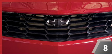
RS PACKAGE - RS GRILLE, DECKLID SPOILER, BLACK BOWTIE, AND ILLUMINATED CAMARO SILL PLATES

Heighten safety with its stability control, traction control, and brake assist while the rear park assist, rear cross-traffic alert, and side blind zone alert helps to keep a safe and protected drive.