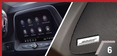
8" TOUCHSCREEN WITH BOSE® 9-SPEAKER SYSTEM

Enjoy scintillating drives with a premium infotainment system with built-in-reversing camera, Apple CarPlay® and Android Auto™ that lets you access your phone, calls, and music with just a touch or voice command.